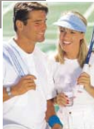
Free tennis anyone?