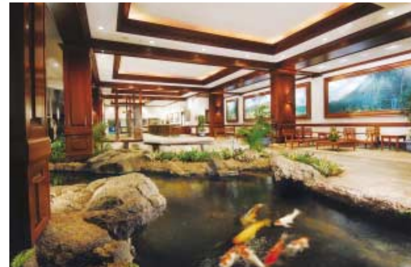
Our tropical, open-air lobby welcomes you to the island.

Aston Hawaii is renowned for always offering guests the best possible accommodations for the price. Come enjoy spacious, beautiful condominium suites and spectacular views of paradise, combined with exceptional value, at Aston at the Waikiki Banyan. You'll quickly understand why Aston is Hawaii's favorite host.