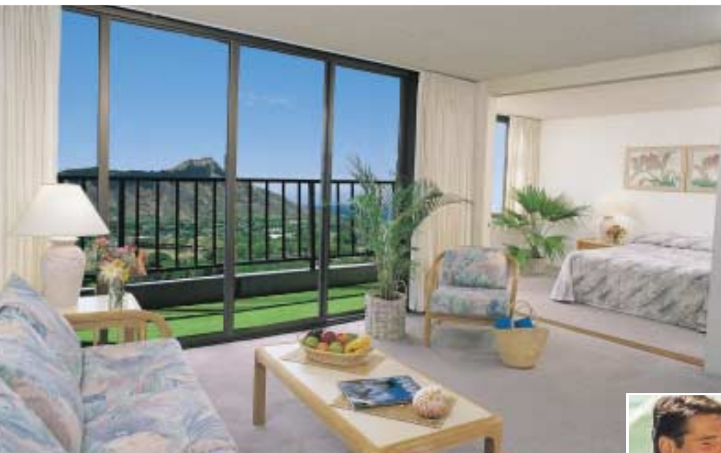
Spread out and get comfortable in your spacious suite.