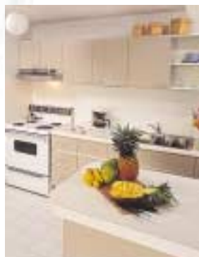
Fully equipped kitchens help vacation budgets.

Information is subject to change without notice.