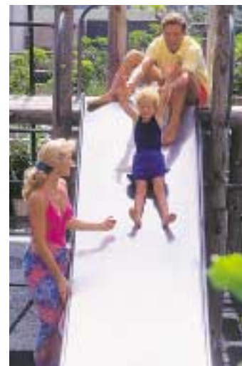
Kids of all ages love our playground.