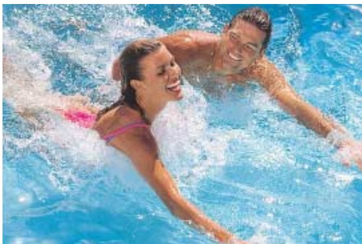
The recreation deck pool overlooks Waikiki.