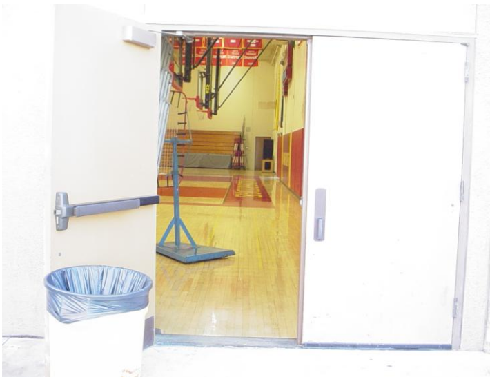
Exit door from outside