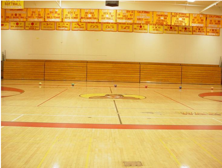
Gym floor from audience