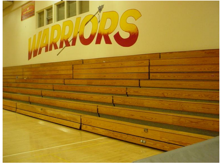
Bleacher's pulled out (the top three are not all the way out) they work, just not out for this picture.